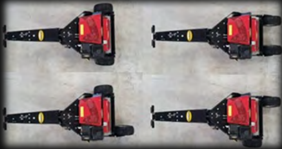
Multiple rear wheel positions