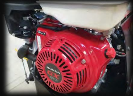
STTrac 700: 8.5 HP HONDA engine STTrac 720: 12,5 HP HONDA engine

For accessibility and stability the STTrac's rear wheels can be set in multiple configurations. Behind, for narrow access situations, Left or right side settings for edging applications and the standard wide position for optimal stability and short turning radius. Or choose a combination of both with one wheel behind and one wheel beside the STTrac .