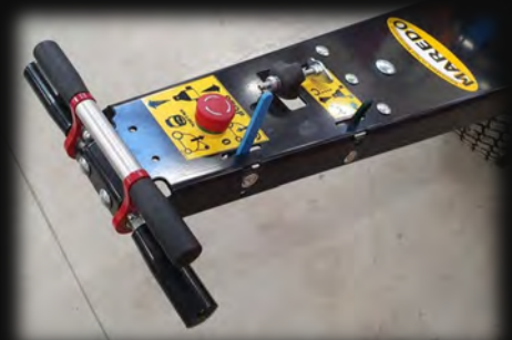
Easy accessible controls