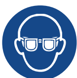
Tightly sealed goggles